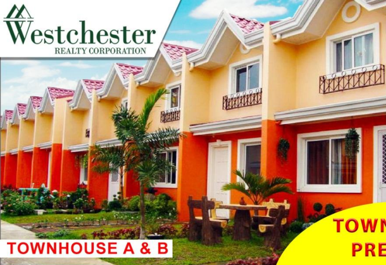
TOWNHOUSE A & B